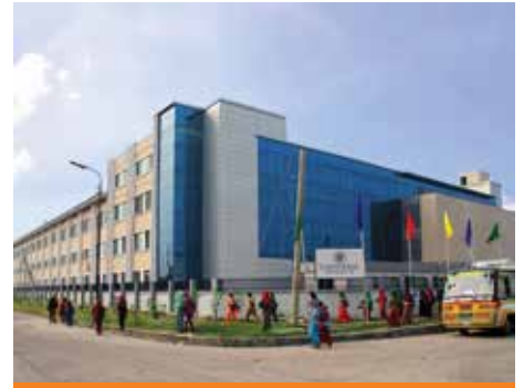
Universal Menswear, Bangladesh