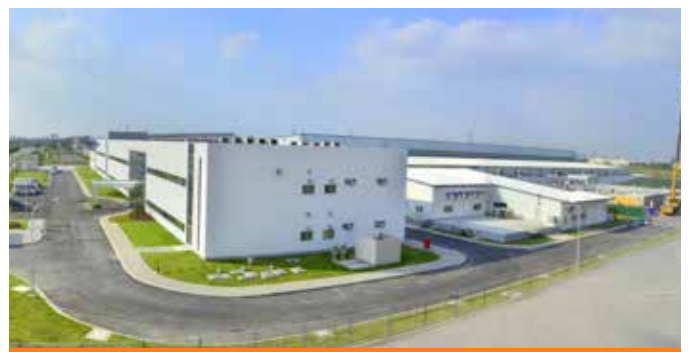
Panasonic Factory, Vietnam