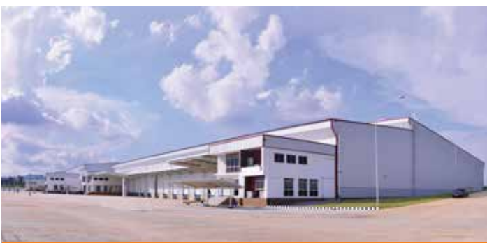
Hemaraj Factory, Thailand