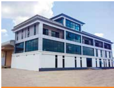
Soft Drink Factory, Myanmar