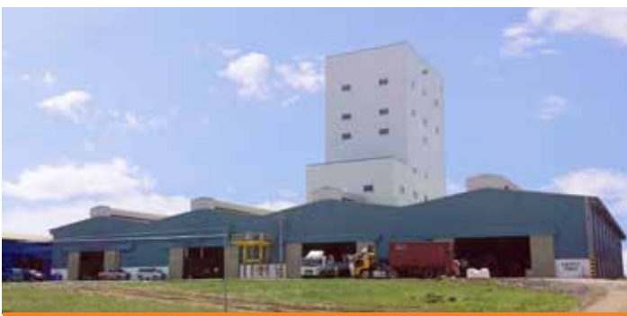
Popular Feedmill, Philippines