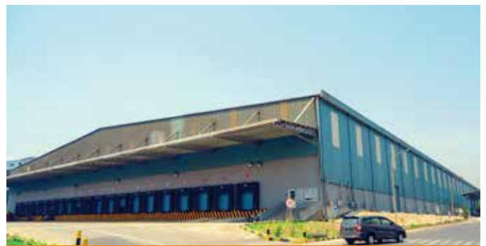
Wilmar New CPC Building, Indonesia