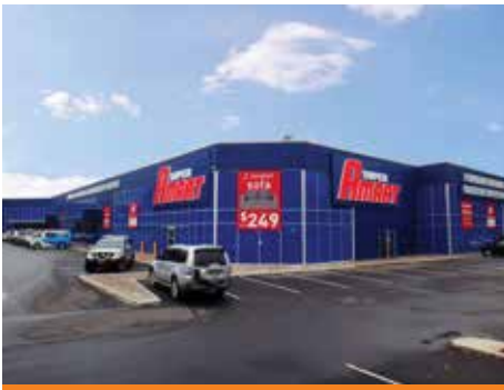
Penrith Trade Center, Australia